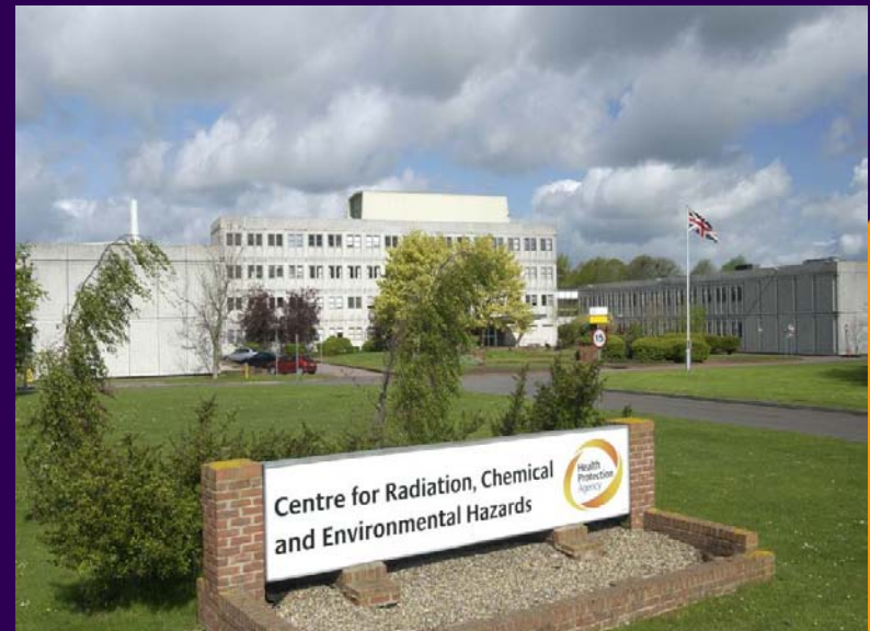
Centre for Radiation, Chemical and Environmental Hazards